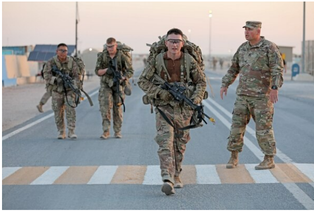
Infantry soldiers deployed in the U.S. Army Central area of operations finish a 12-mile ruck march in less than three hours as the final event in Expert Infantryman Badge testing at Camp Buehring, Kuwait on Saturday, June 1, 2019.

Events will be graded on “go or no-go” completion, but soldiers can still receive a few “no-go’s” and earn the badge.