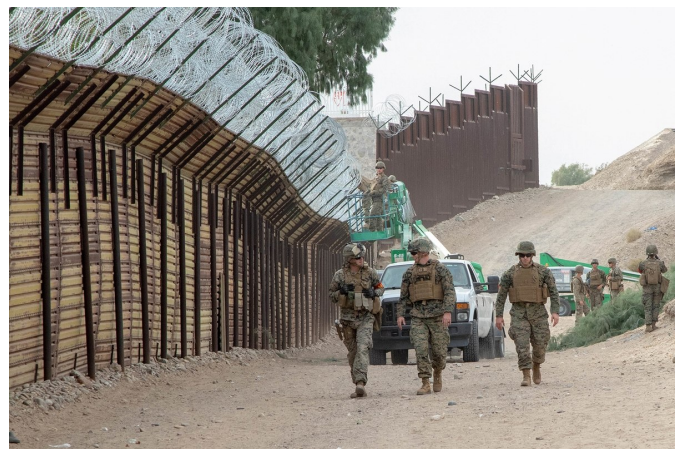
Marines with the 7th Engineer Support Battalion, Special Purpose Marine Air-Ground Task Force 7, walk along the California-Mexico border at the Andrade Point of Entry in Winterhaven, California, Nov. 30, 2018.