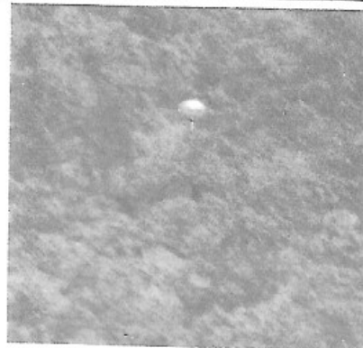
Creates instant LZs