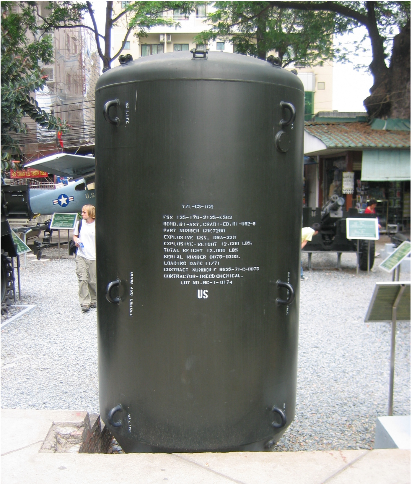
Figure 1 Daisy Cutter on display - Saigon - 2012