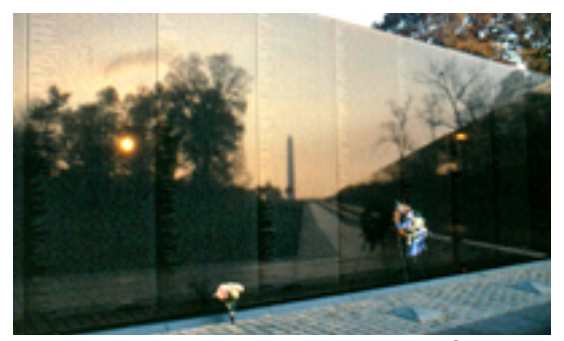
Vietnam Veterans Memorial reflects the Washington Monument at sunrise.

The Vietnam Veterans Memorial serves as a testament to the sacrifice of American military personnel during one of this nation's least popular wars. The memorial consists of three distinct sections. The Memorial Wall, the Three Servicemen statue and flagpole and the Women in Service to the Vietnam War statue. The purpose of this memorial is to separate the issue of the sacrifices of the veterans from the U.S. policy in the war, thereby creating a venue for reconciliation.