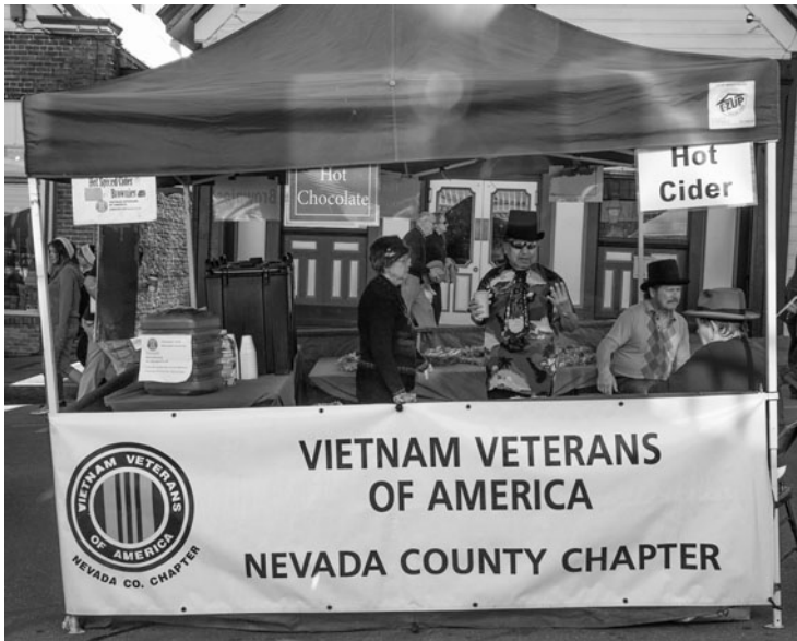
Chapter 535's Booth at Victorian Christmas in Nevada City.