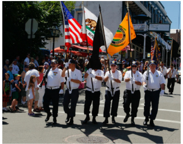
4th of July Chapter 535 Color Guard in Nevada City.