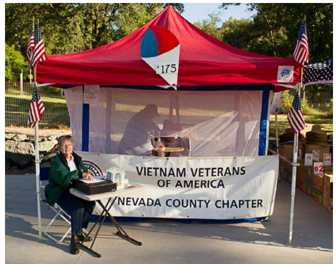
Chapter 535 Snow Cone Booth at Rough n Ready Secession Day Celebration.