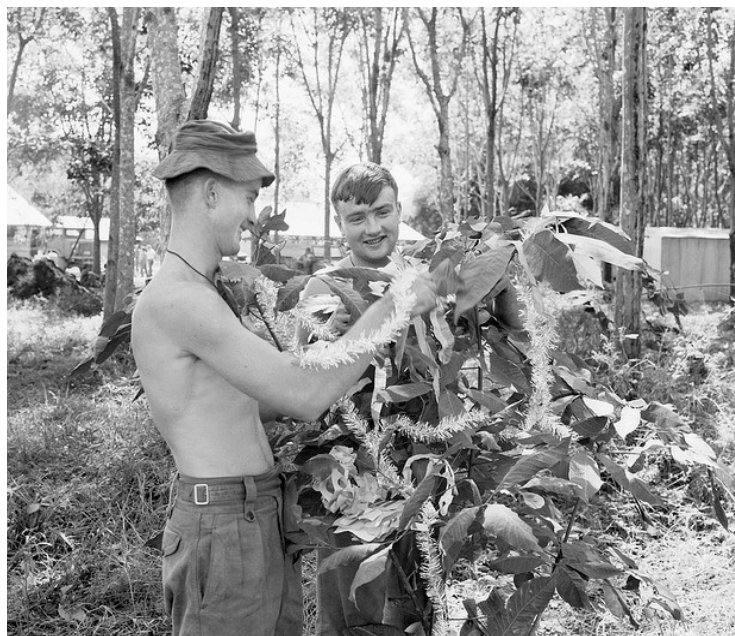
Christmas Vietnam 1967.